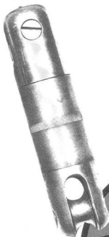
Model TSO Topside multiple openings with single lift steel reinforced eye.